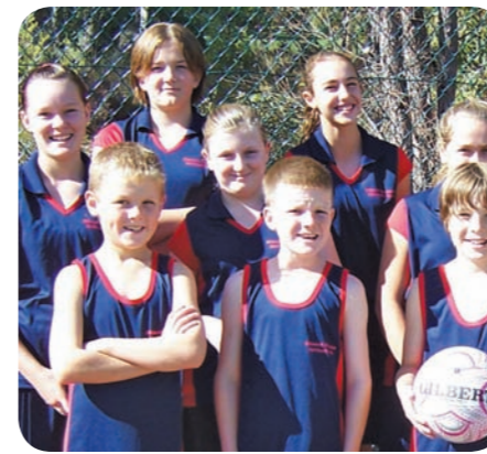
Mt Helena Junior Netball Club