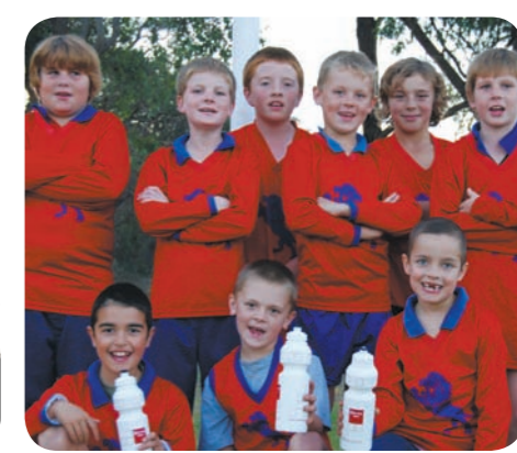
Mt Helena Junior Football Club